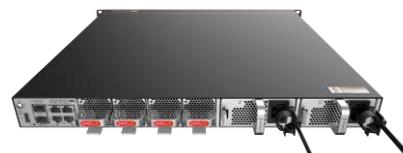
NetEngine 8000 F1A (AC)